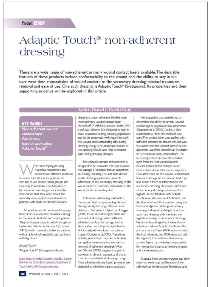
Fig 1 – ADAPTIC TOUCH® product review

Bianchi, J. and Gray, D. Adaptic Touch® non-adherent dressing, Wounds UK Journal, vol. 7 2011, pp 12-123