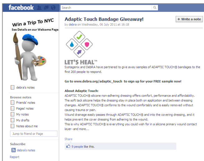
DebRA announcing the initiative on their Facebook page

EB is a rare, genetic disorder that affects every racial and ethnic group, as well as both genders, equally. Approximately 1 out of every 50,000 live births are affected. Because those affected with the disorder are lacking a critical protein that enables the two layers of skin to bind together, blisters and skin tears result from the slightest friction or trauma.